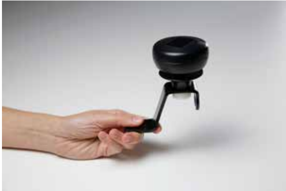
Mast Mount for Ultrasonic Portable Solar